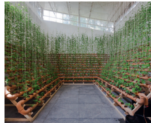
6 Daniel Steegmann Mangrané, A Transparent Leaf Instead of the Mouth , 2016-17, at Nottingham Contemporary. 7 'Countryside, the Future', installation view, at the Solomon R. Guggenheim Museum, New York