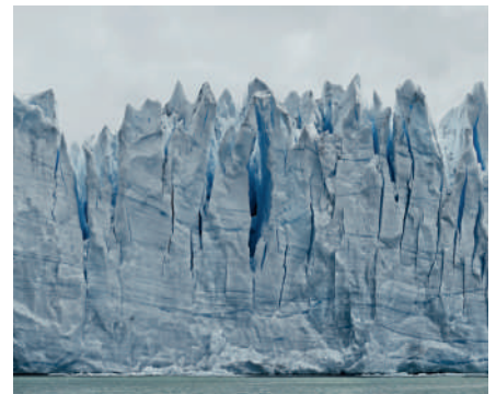
5 Frank Thiel, detail of Perito Moreno #16 , 2012-13, at DePaul Art Museum, Chicago. 6 John McCracken, Trebizonoum , 1972, at Camden Arts Centre, London. 7 The entrance to E-Werk, Luckenwalde